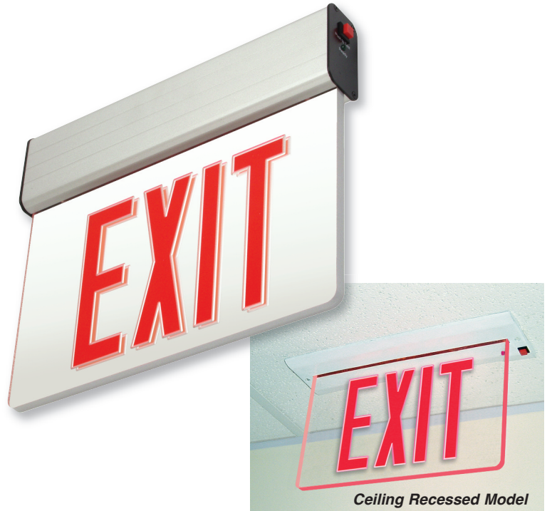
Ceiling Recessed Model